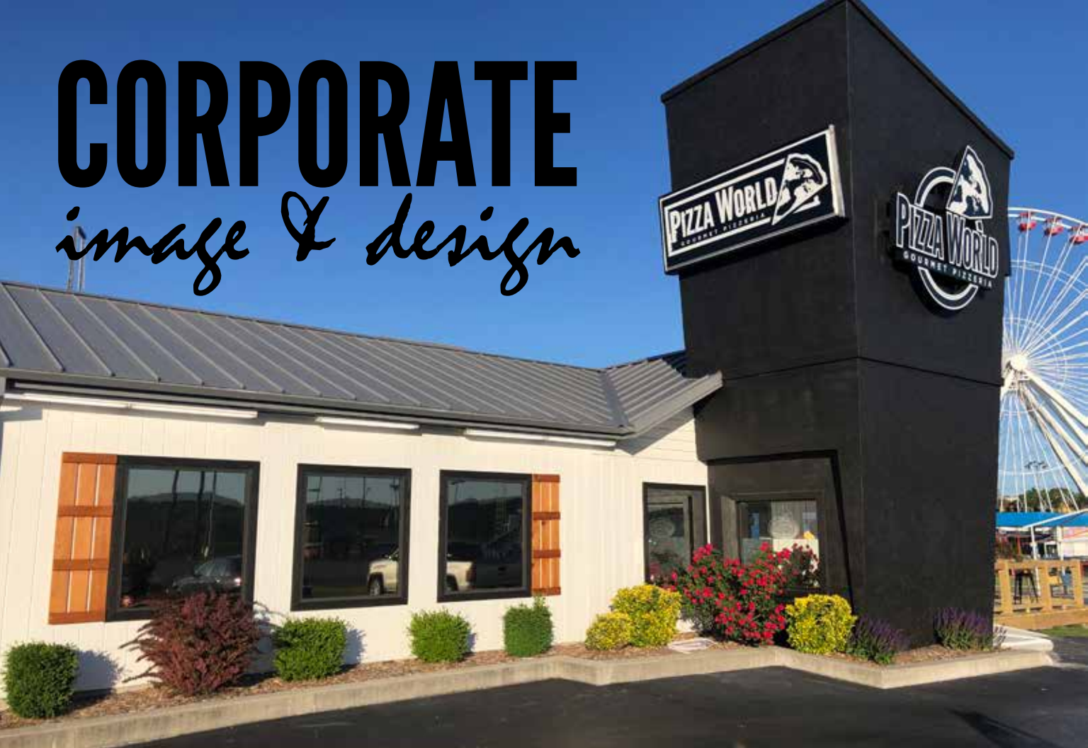
image & design